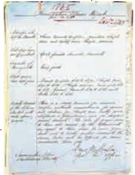
CH287_CP 98, ICPS 943/1867 - Immigration Report

Immigration was one of these areas of dispute and change. Until 1870 the administration of immigration into the colony was clearly in the hands of the provincial governments. Then the General Government passed the Immigration and Public Works Act in 1870 as part of the expanded programme of immigration and public works associated with the Colonial Treasurer, Julius Vogel. An Agent General was appointed in London over the agents acting for the various provinces. In 1871 it became compulsory for the provinces to put immigration under the control of the Agent General. Canterbury's immigration staff became employees of the General Government in 1872, and the provincial immigration officer became the General Government immigration officer for the province. However, the Provincial Government continued to be involved in immigration until the time of its demise.